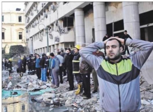
An Egyptian man on Friday stood in the rubble of a deadly explosion at the Egyptian police headquarters in downtown Cairo.